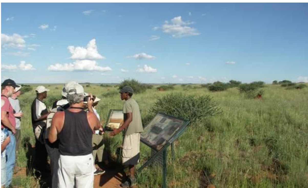
Fig. 8: A community guide at Wildebeest Kuil interacting with tourists.

The inner highland of South Africa, the Karoo is another remarkable rock art region. It is a vast, moderately contoured arid plateau where rock shelters are rare and the prehistoric art that can be found here is basically engravings on open rocks. They encompass a variety of techniques, from rather rough pecked motifs to fine line engravings with outstanding naturalism.