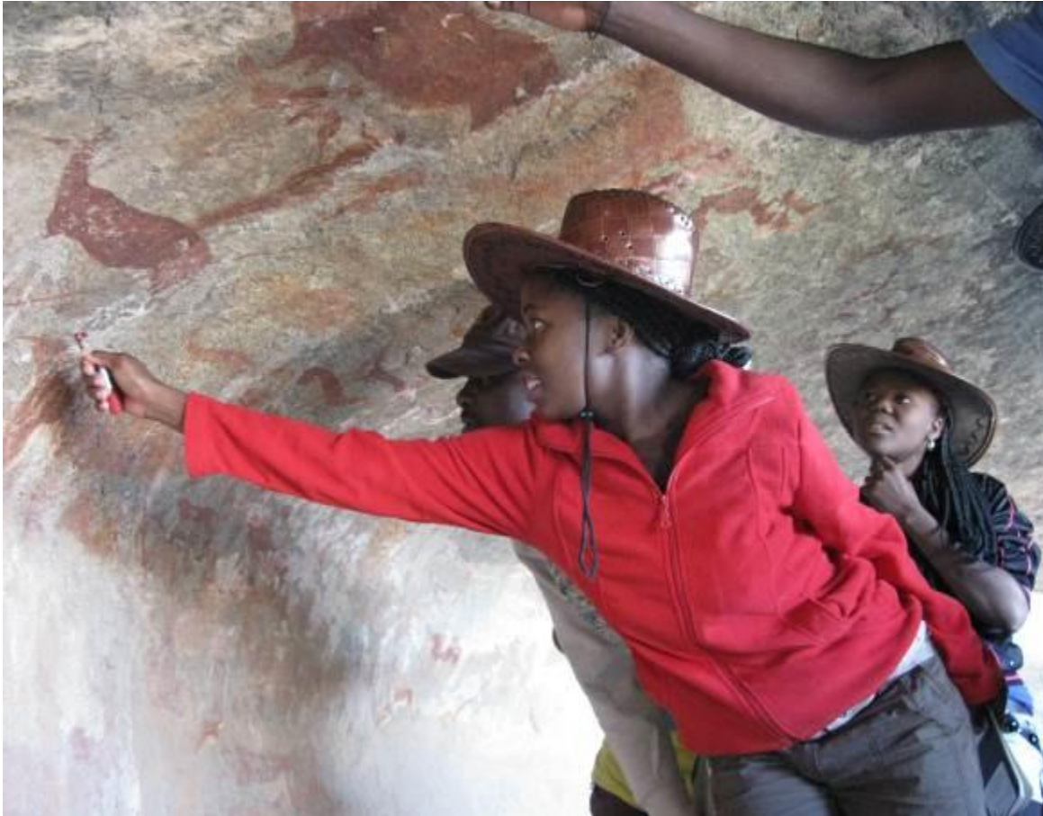
Fig. 3: Female community guides from the surroundings of the Dâureb/Brandberg during their first encounter with rock art in the high mountain in 2012