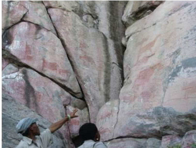
Fig. 4: Depiction of a rock art panel from Tsodilo Hills, Botswana, one of the main panels that the local people interpret as a typical depiction of a hunting scene. The local San guides interacting with the rock art.