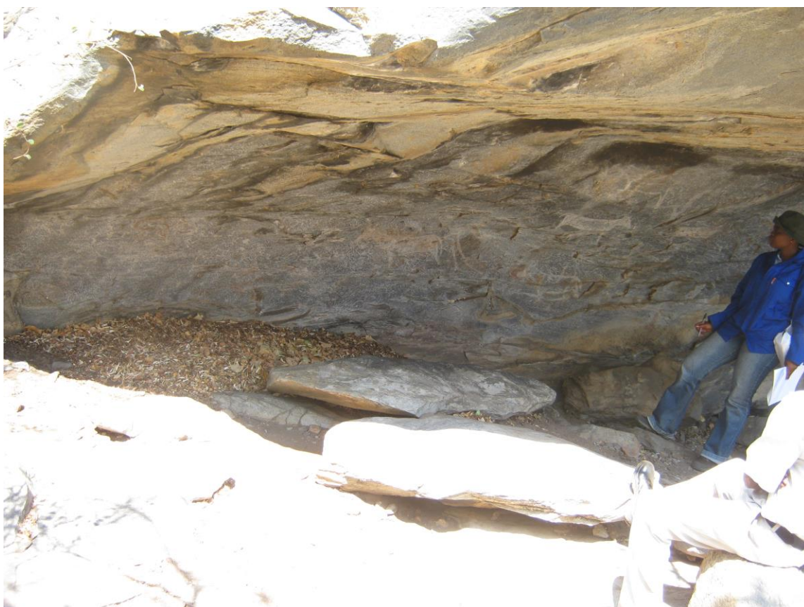
Fig. 5: Tsodilo white paintings.

Found on the peripheries of the region and living as pastoralists, Herero speakers also claim continuous occupation of the hills but currently they are excluded from the site. These communities all have sacred places, including rain-making shrines for the Hambukushu, within the hills that they to some extent keep secret. They are afraid that these places will be lost when the old people die because of modernity, new perceptions, continuous interaction with “outsiders”, and lack of interest from the young generation.