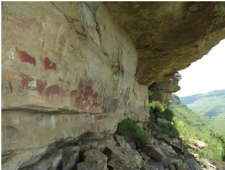
Fig. 7: Game Pass Shelter at Kamberg in the Drakensberg where e.g. in 2007 San from all over the Drakensberg conducted rituals.