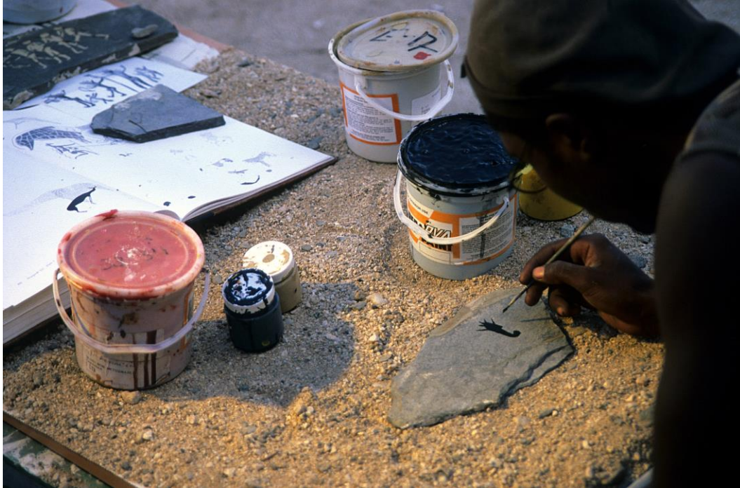
Fig. 2: With the closing down of the tin mine in Uis in 1990 most job opportunities vanished in the wider Dâureb/Brandberg region. Subsequently some people tried to generate income from tourism either as guides to the rock art sites or by producing souvenirs with rock art motifs (photo taken in 2006). Today only guiding still is a relatively safe source of income since souvenir production of this type has ended.

Another important Namibian rock art region with outstanding rock art lies south of Twyfelfontein being well visible from there. It is the Dâureb/Brandberg mountain, which is entirely different in character from Twyfelfontein, being a huge granitic inselberg rising up to over 2500 m a.s.l. (Lenssen-Erz & Erz, 2000). Rock paintings can be found mainly in the upper regions. The whole mountain harbours about 1000 rock painting sites most of which have been published comprehensively based on the outstanding documentation of Harald Pager (Pager, 1989-2006). Paintings largely date from the Later Stone Age period of 4000-2000 years ago (Richter, 1991), and a specific painting of which a small exfoliated piece was excavated in a stratified layer was dated before 2760 \pm 50 BP (KN-3544, Breunig, 1989). The art ( Fig. 3 ) comprises largely human figures in a rich variety of activities. Motifs of the animal kingdom are dominated by rather few species (springbok, giraffe, gemsbok, ostrich, zebra, and elephant) that do not live in the mountain. Animals may have been used as metaphors for imploring or celebrating an intact and prolific environment (Lenssen-Erz, 1994, 1997). These metaphors would have worked by invoking the encyclopaedic knowledge that the people entertained about the animals and the environment. Human figures, on the other hand, stood for specific social values: community, equality and mobility (Lenssen-