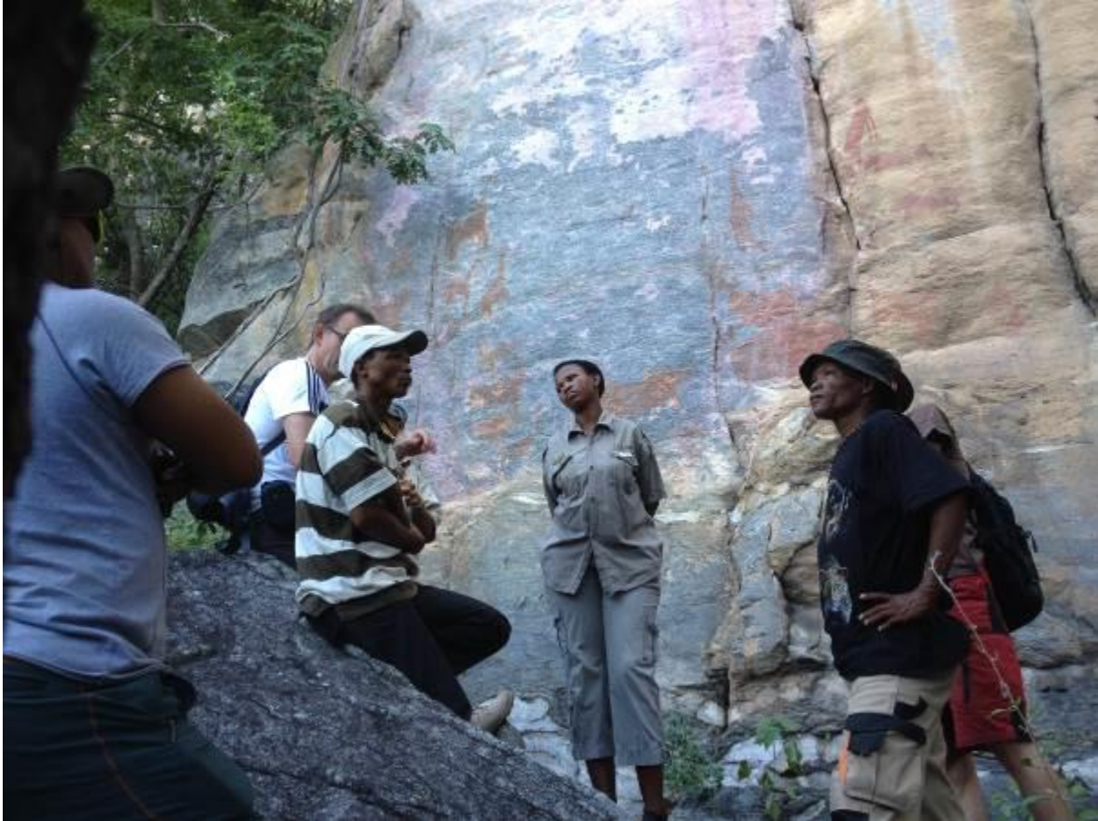
Fig. 6: San hunters from Tsumkwe, Namibia, visiting relatives in Tsodilo, Botswana, and exchanging views about details of game animals in rock art.

According to the international community, the rock art in Tsodilo is a legacy of the African and the world's heritage that transcends political boundaries. In this outsider's view the Ju/hoansi are favoured as true heirs of the art and of the site in general. By contrast, the local people in Tsodilo perceive the art as a token of their diverse cultural backgrounds, their indigenous knowledge of the ecosystem and of their cultural values. Thus, despite some competition, there is prevailing harmony in diversity; the view of rock art as heritage reinforces social unity of the community and creates good relations between cultural groups in Tsodilo and the visitors. This relation manifests itself through collective and pragmatic symbolic efforts to conserve this cultural property with its important cultural values. In the quest to create community harmony, there is a tendency of standardising even the interpretation of this complex material culture across the diverse cultural groups residing in the area. However, the rock art in Tsodilo and its evident diverse interpretations through local lenses is a clear example of diverse values based on the different knowledge values and cultural heterogeneity in the vicinity of the hills. The interpretations