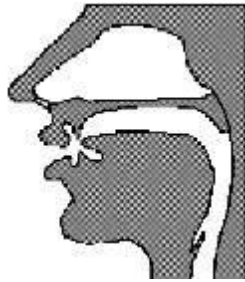
Figure adapted from Nurse (1985)