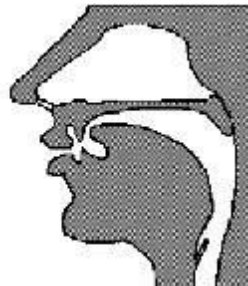
Figure adapted from Nurse (1985)