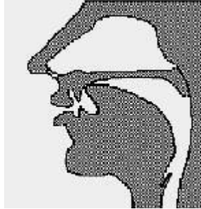
Figure adapted from Nurse (1985)