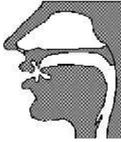
Figure adapted from Nurse (1985)