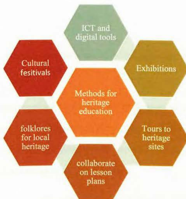
Figure 5: Methods for teaching Heritage Education

Figure 5 summarises methods that can be used in the teaching of heritage education both in the formal and informal context.