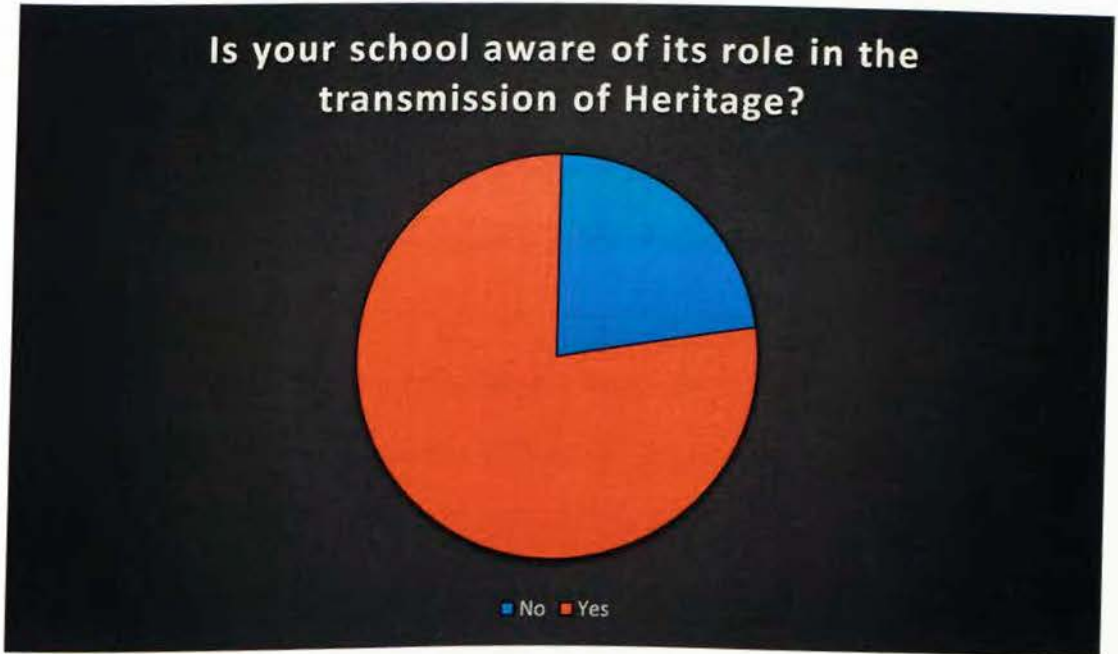
Figure 3: The role of schools in heritage transmission

Question 11. Would you say your school is aware of its role as an instrument in the transmission and preservation of heritage? Explain,