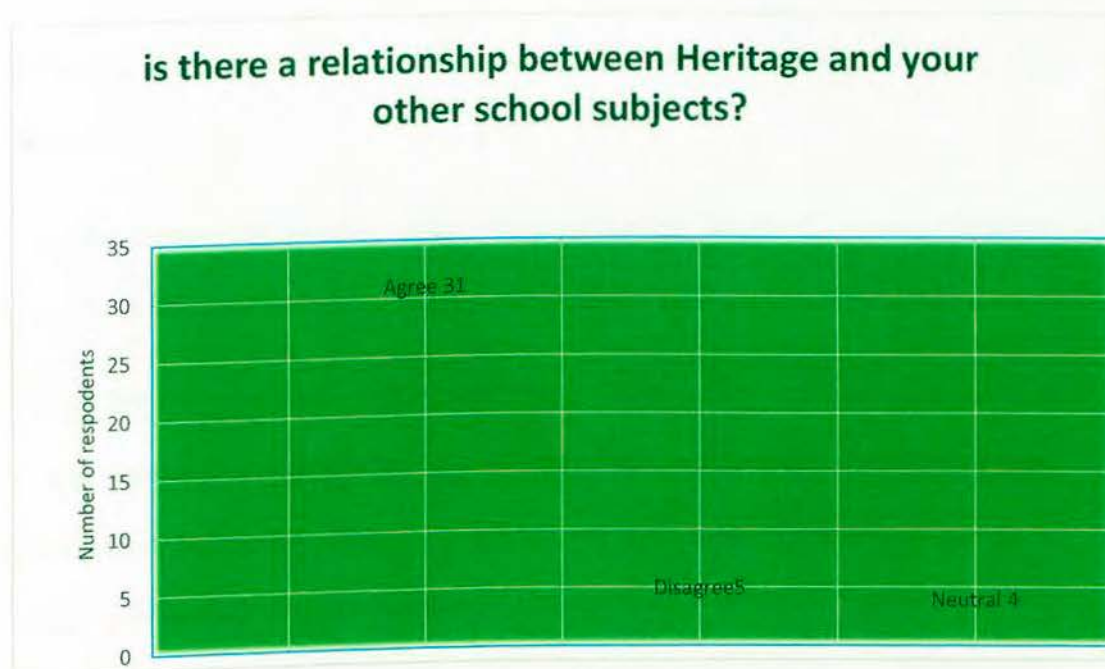
Figure 2: relationship between Heritage and other school subjects

Question 9. Is there a relationship between heritage and your other school subjects?