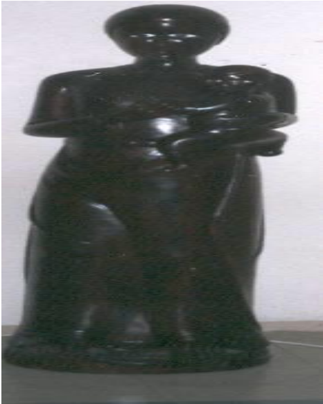
Figure 1 Traditional Maria (Wood Carving)