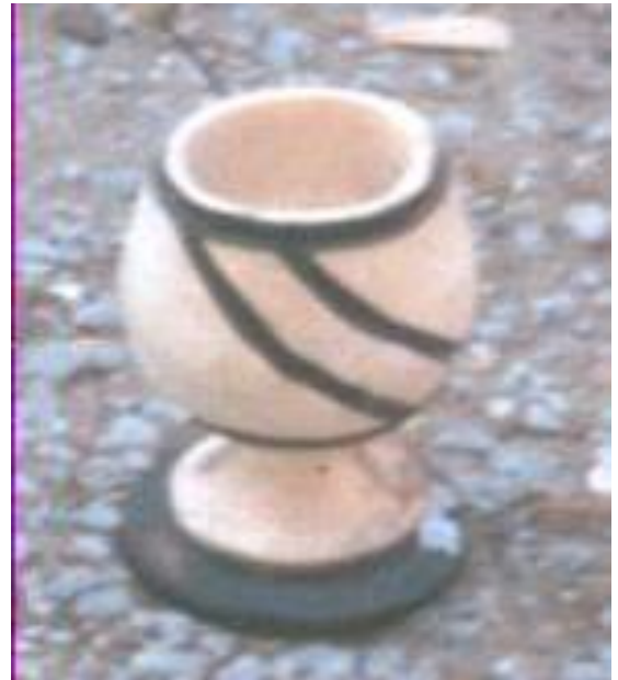
Figure 7 Traditional Chalice (Wood Carving)