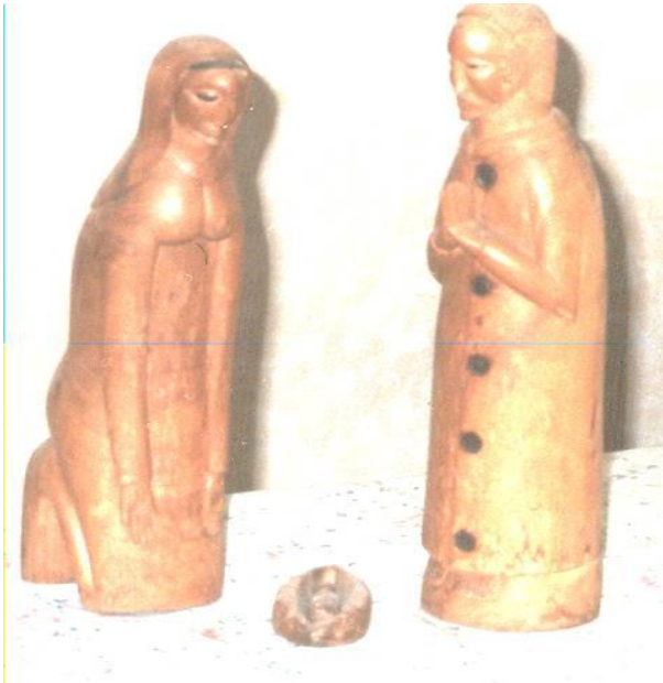
Figure 5 Traditional Holy Family Maria, Jesus & Joseph