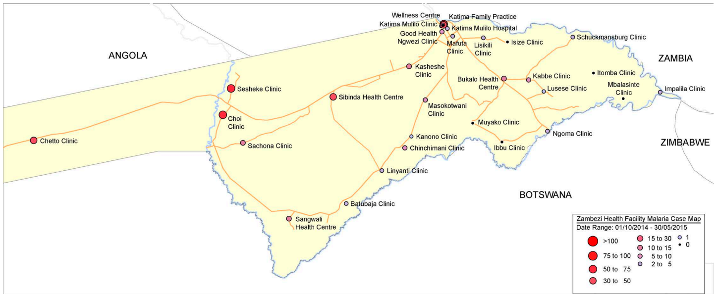
FIGURE 2 Map of western Zambezi region, Namibia, showing the distribution of malaria cases by health facility for the 2014–2015 malaria season.