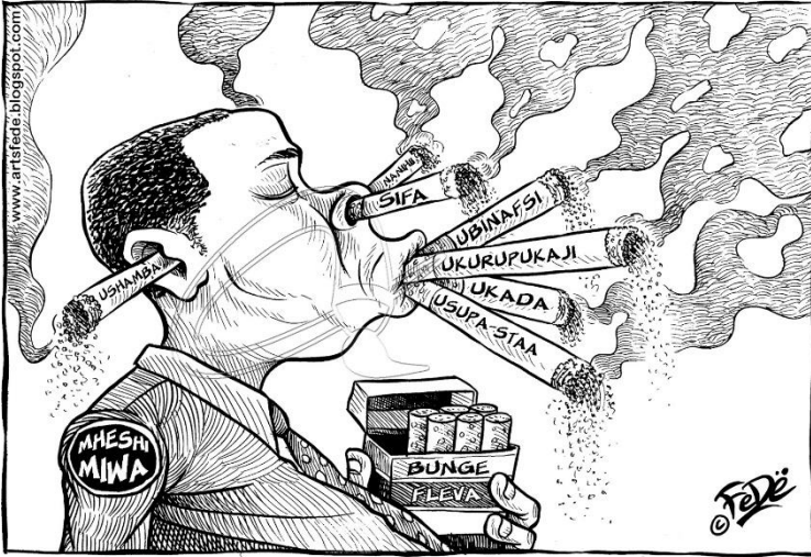
Figure 2. Cartoon Showing Various Boils a Person may have (H.E. Member of Parliament)

The instructors continued to clarify that this cartoon is representing a Member of Parliament who has a number of boils ranging from USHAMBA (hooligan/lout) to USUPA-STAA (super star) behaviors. From the above illustrations, it is evident that the word Jipu was alarming to the foreign language students in the context of language use. Its use was very broad and there was a need to understand its meanings. However, the translation method alone could not handle the situation. As observed, the instructor used certain illustrations and context-based examples for them to learn the multiple senses easily. The instructors from this class added that in Kiswahili, there are many words that have associative meanings and their interpretations require contexts. He said; “if you hear a word like endesha (drive), it may refer to fanya gari lisogee kutoka sehemu A kwenda B (moving a car from point A to B), fanyia mtu mambo ya kuudhi (ill-treat one), harisha (someone is experiencing diarrhea), etc”.